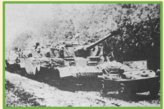
Left, M42 Mortar Centre, Paratroopers 19 August 1944 Right, Schwimmwagen leading T-4 Tanks