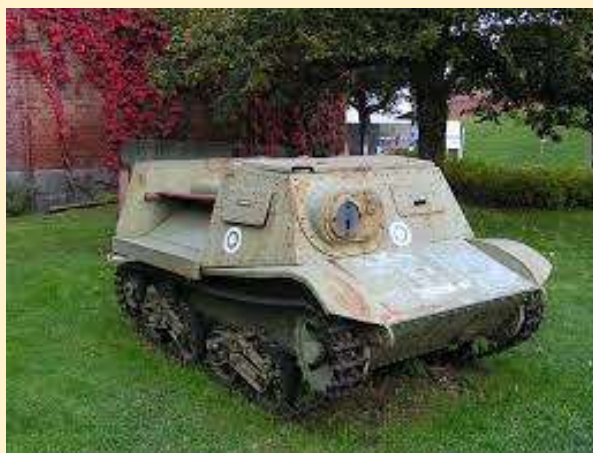
Ford rusesc de captura

During the campaigns of 1941-1942 the Romanian Army captured 30-40 Komsomolets artillery tractors, the majority of these had damaged engines which would normally have prevented their reuse but the engine was a licensed built Ford unit so spare parts were available in Romanian/Germany due to Ford plants in these countries.