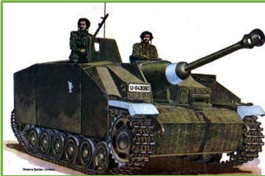
TA assault gun.

Between November 1943 and August 1944 Germany delivered 108 Sturmgeschütz III Ausf G that were distributed to the 1st Armoured Division, the 8th Motorised Cavalry Division and the Armoured Detachment of the 4th Army, under the designation "TAs" (Tun de Asalt, Assault Gun).