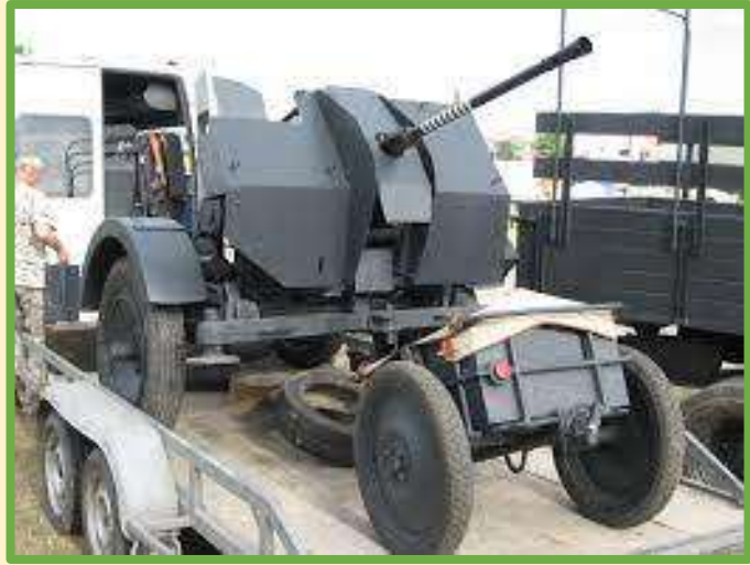
German 20mm Flak 38 anti-aircraft gun on a trailer