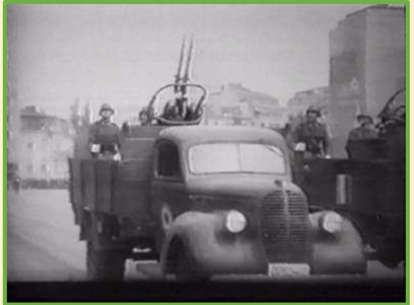
Ford truck with twin machine gun mount.