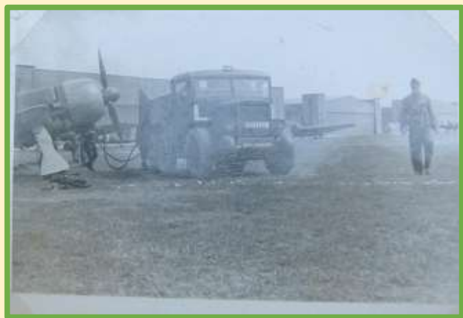
French Latil fuel truck

Captured Russian and lend-lease vehicles were also used, the GAZ truck was derived from the Ford Model-AA so spares were available.