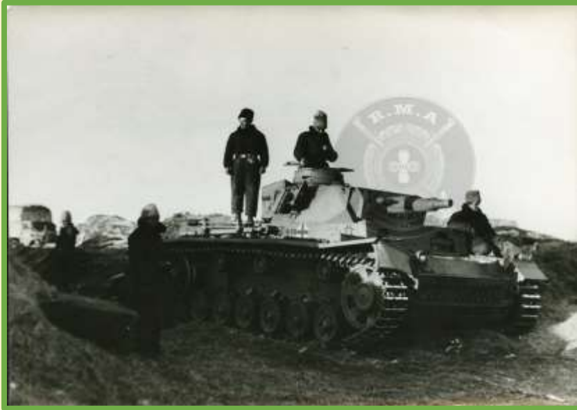
T-3 medium tank with a Romanian crew

In September 1942 the Germans eventually agreed to sell the Romanians some more modern armour, 22 Panzer III N which hardly helped to improve the fire power of their Armoured Divisions as they were armed with the short 75L24 gun but was an improvement on the ageing T-2 and R-35 tanks, this was the last version of the Panzer III to be produced. The majority were lost in the retreat from Russia.