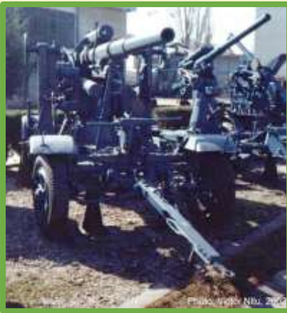
88mm Krupp AA gun model 1936