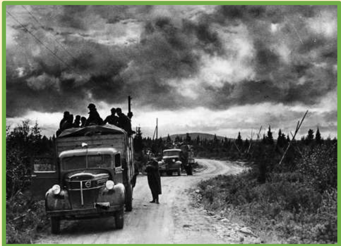
Tatra truck with a Ford in the distance.