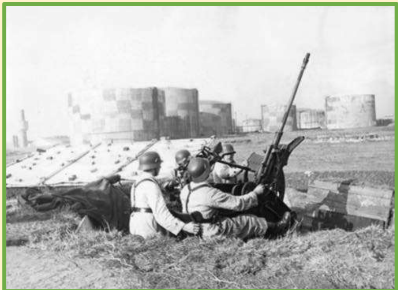
German light flak gun at Ploesti oil complex