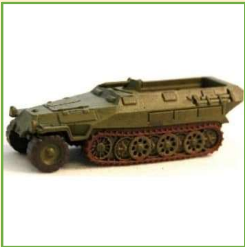
Sd.kfz 250/1 in Romanian colours

Not listed for use in a generic Reinforced Platoon Selector from the Bolt Action rulebook for Romania, only in a Theatre Selector