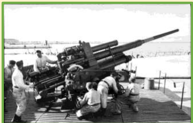
Emplaced 10.5cm FlaK 38

It costs around 300pts but you will need a train tow or flak tower emplacement .