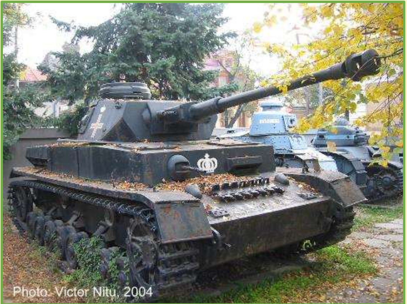
The T-4 tank in the courtyard of the National Military Museum in Bucharest

Not listed for use in a generic Reinforced Platoon Selector from the Bolt Action rulebook for Romania, only in a Theatre Selector