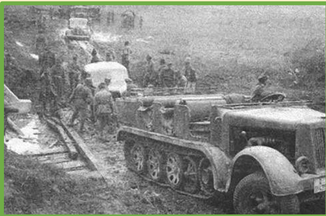
Famo tractor towing mired vehicles during the advance in Transylvania, September 1944.

The tractors was purchased by Romania in 1943 and were delivered to the 1st Armoured Division and 8th Cavalry Division. It remained in the service of the Romanian Army after the war until early 50s.