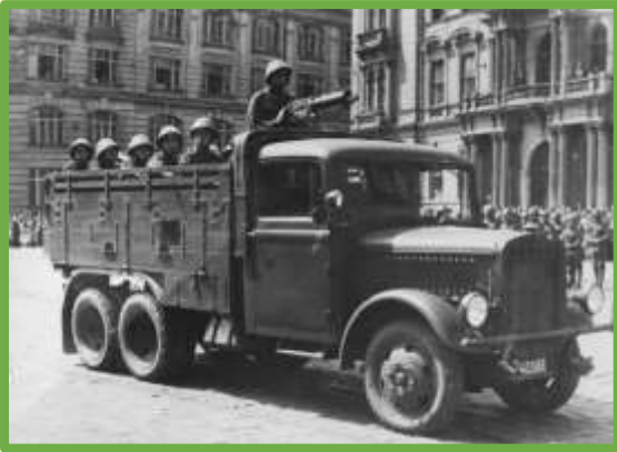
Praga truck with a machine gun.