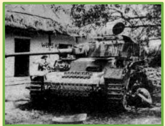
Left, shipped in German tank grey from the factory, right with German camo transferred from an active unit.