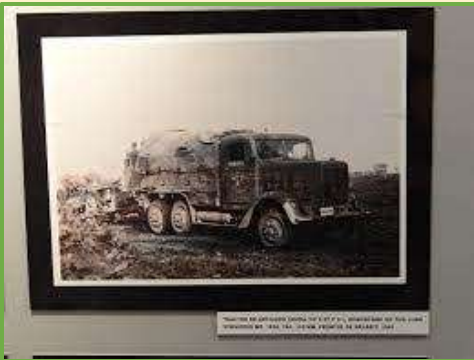
Skoda 6STP6L truck