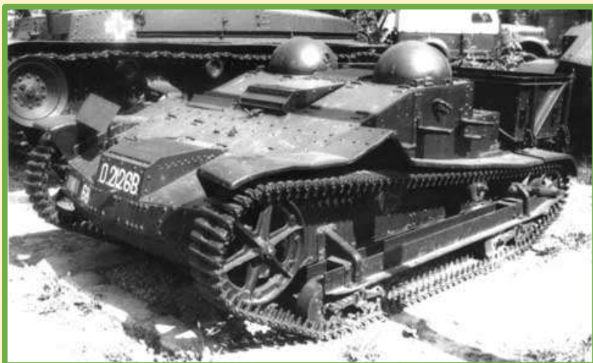
Malaxa tip UE

Not listed for use in a theatre selector or a generic reinforced platoon selector in the Bolt Action Army Book for Romania