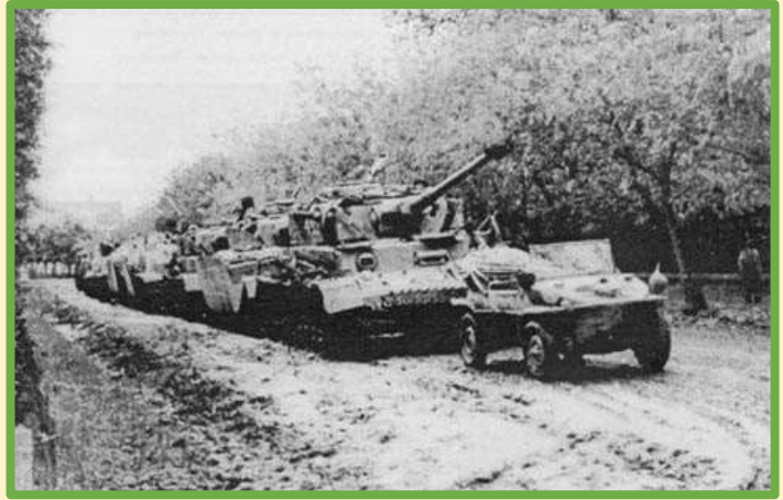
(left) 1941, Opel Olympia from 1938 photographed in front of the Civil and Industrial Construction High School, the former headquarters of ACRR Banat-Crisana. (right) Volkswagen Schwimmwagen leading a column of T4's in Transylvania.