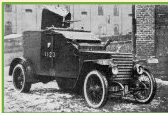
Left, Peugeot AM in Romanian service. Right Peugeot in Polish service.

The Peugeot armoured car was built in two main versions, the Peugeot AM ("automitrailleuse") was armed with an 8 mm (0.31 in) Hotchkiss Model 1914 machine gun, and the Peugeot AC ("autocannon") armed