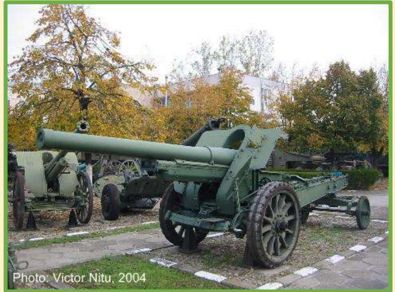
100mm Skoda field howitzer model 1934 150 mm Skoda 150 model 1934 WorldWar2.ro