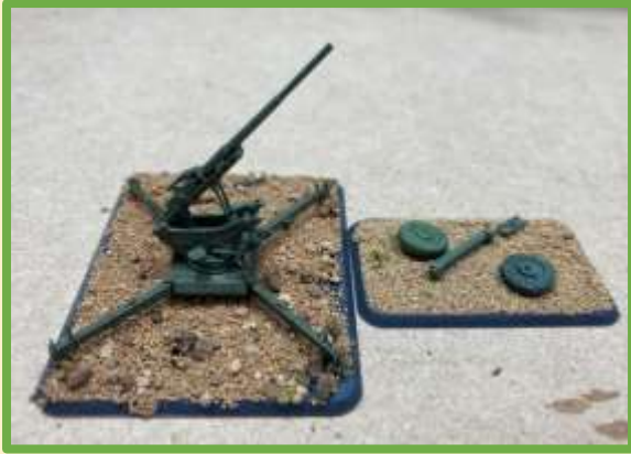
The Vickers 75mm, Wargame 3D