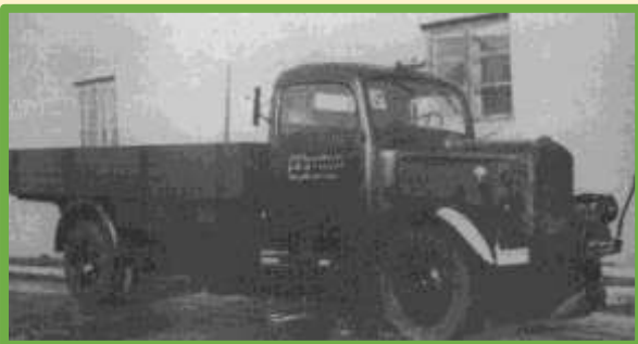
Mercedes Benz L 3000 S