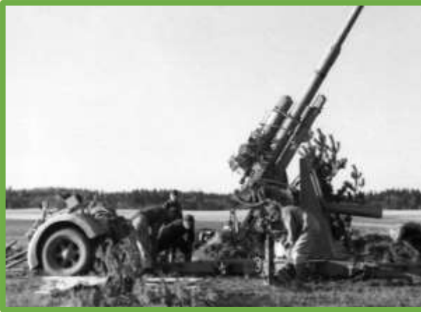
8.8cm Flak 36 being emplaced