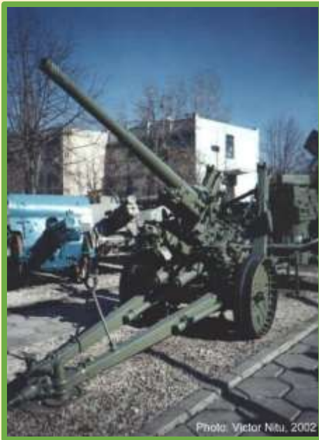
Romanian Vickers 75mm flak gun