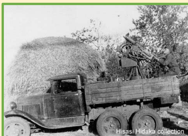
A 37 mm Rheinmetall battery in the Battle of Odessa, machineguns mounted in anti-aircraft role on a GAZ truck platform