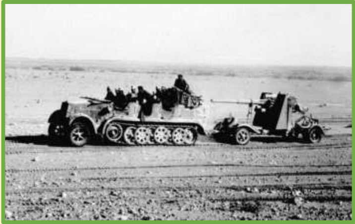
8.8cm Flak 18 towed