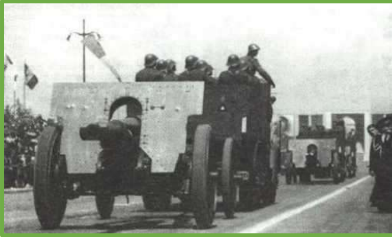
A 105 mm Schneider model 1936 towed by a Skoda 6STP6L truck

Not listed for use in a theatre selector or a generic reinforced platoon selector in the Bolt Action Army Book for Romania