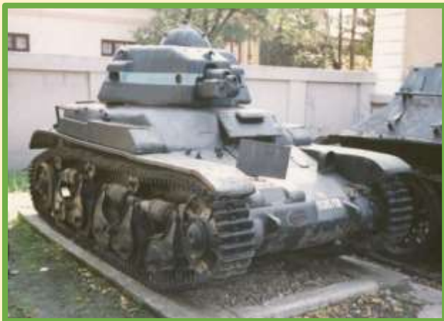
R-35 at National Military Museum in Bucharest