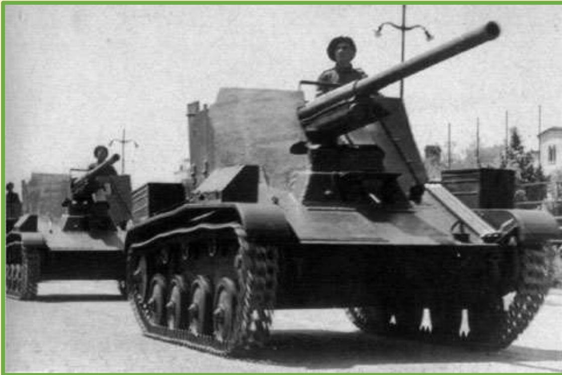
TACAM T-60 at the parade. Bucharest, 10 May 1943

After 1941 the Romanians realised how out of date their anti-tanks guns were when facing T-34 and KV-1 tanks, this problem was compounded by Berlins miserly arms supply plus preventing them buying from Czech arms factories forcing them to re-purpose captured equipment. Lieutenant-Colonel Constantin Ghiulai was tasked to design a self-propelled gun using captured T-60 tanks, armour plate from BT-7 tanks and Soviet 76.2mm F-22 field guns. Quite a few Russian engines were licensed U.S. designs the T-60 being powered by a GAZ 202 which was a Dodge-Derretto-Fargo FH2 so spares were available in Romanian and Germany, total production was around 35.