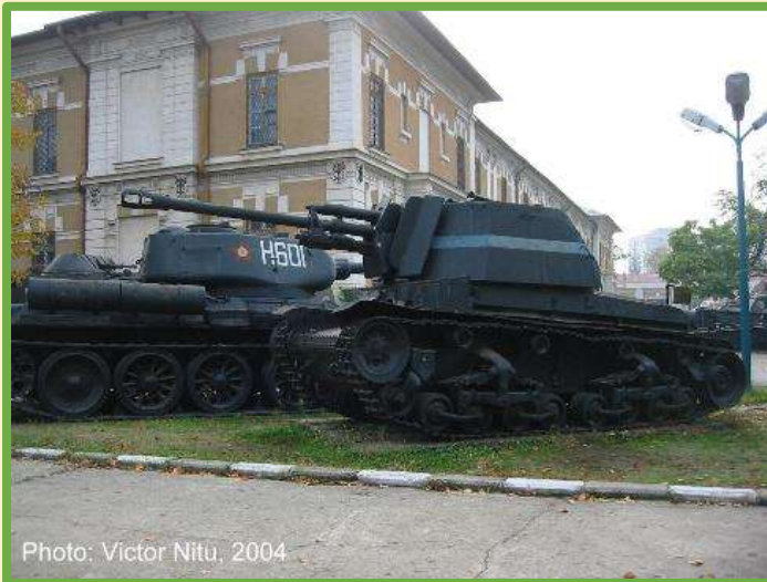
The TACAM R-2 tank destroyer in the courtyard of the National Military Museum in Bucharest.