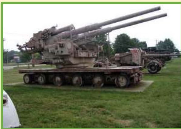
12.8cm FlaK 40 Zwillig