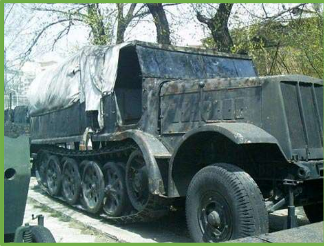
Famo Sd.Kfz. 9 half-tracked carrier at the National Military Museum of Bucharest

Not listed for use in a theatre selector or a generic reinforced platoon selector in the Bolt Action Army Book for Romania