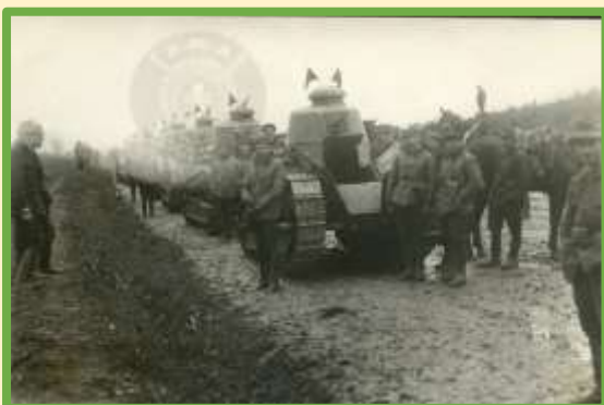
Romanian FT-17 with crew

At the outbreak of the war in the East, the outdated FT-17 tanks, designated "FT", formed the independent FT Tank Battalion. They were used for security duties in important industrial and urban centres of Romania (Bucharest, Ploiesti, Sibiu, and Resita) and training. They played an important role in the rapid annihilation of German forces in these centres during the insurgency of 23 August 1944. All of them were confiscated by the Soviets in February 1945.