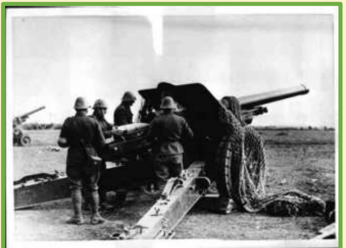
1 st Guards artillery with Skoda M34 100mm Skoda 150mm M34 in action