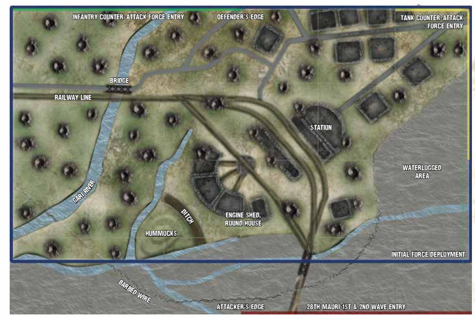
SCENARIO 4 - CASSINO II: THE RAILWAY STATION