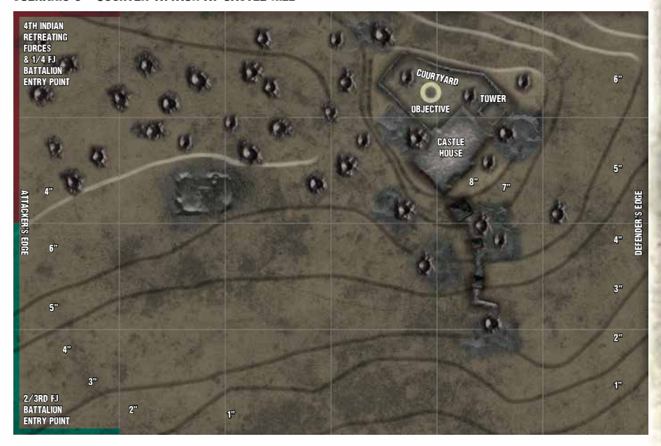
SCENARIO 5 - COUNTER-ATTACK AT CASTLE HILL

Scenario 7: Operation Revenge New map (right).