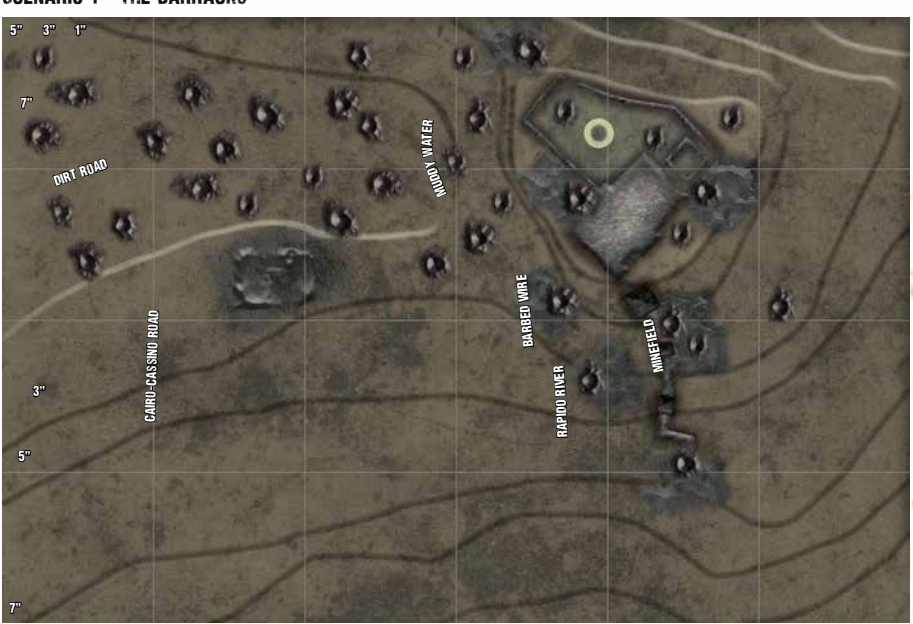
SCENARIO 1 - THE BARRACKS

Finally, players place objective markers. Starting with the defender three objective markers are placed in the ruins. Each objective marker must be placed in a ruin on the Rapido River side of the road. Each objective may not be placed in a ruin that is closer than two ruins away (i.e. they can be placed in a ruin that is two ruins away but no closer).